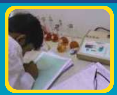
Analytical Chemistry Lab